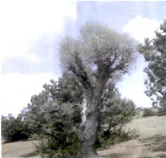
Figure 3. Regenerating native Olive tree after severe P. australis infestation at Eso, Atsebi-Wemberat District (Picture taken on 6 th of April 2013).